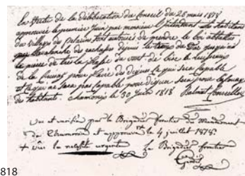
archives winter 1818

1931 maxi known extensions (+ year) damages